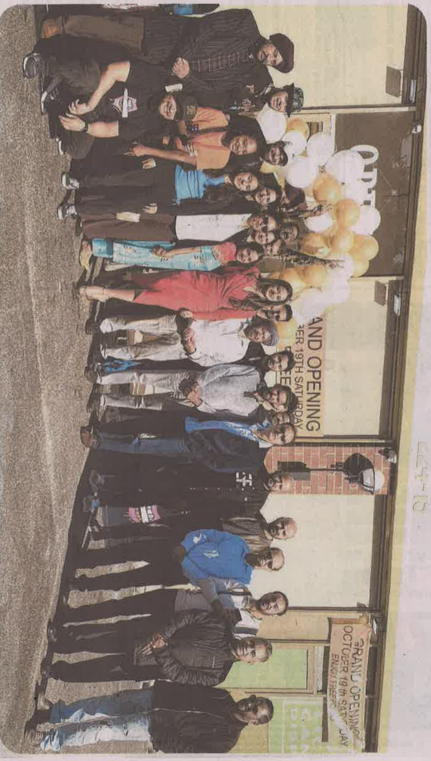
Bayside Cannabis Dispensary has officially opened its doors*

They are in the early stages of planning community events and initiatives to give back, aiming to show locals that they are community members dedicated to delivering top-notch service.