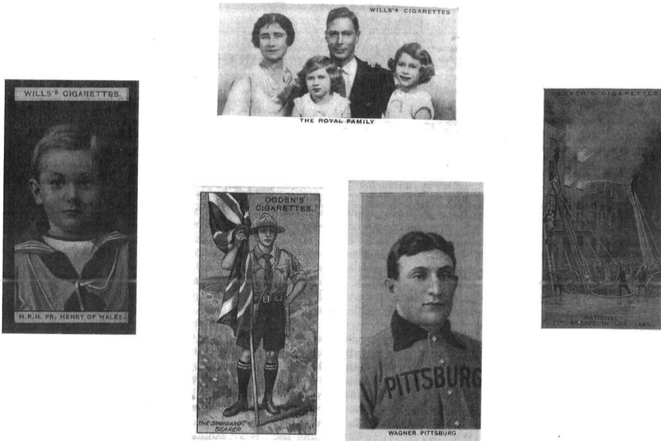
Figure 2 Selected cigarette cards featuring the Royal Family (King George VI, Queen Elizabeth, Princess Elizabeth and Princess Margaret Rose) and Prince Henry of Wales (W.D. & W.H. Wills/Imperial Tobacco Company); the "Standard Bearer" boy scout (Ogden's/Imperial Tobacco); the "National Fire-Escape in Use, 1846" (John Player & Sons/Imperial Tobacco); and Pittsburgh Pirates baseball star, Honus Wagner.