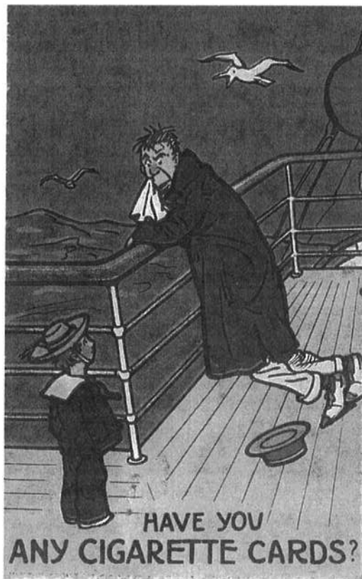
Figure 1 A humorous postcard illustrating the ubiquity of young cigarette card collectors.

The heyday of tobacco-sponsored trading cards ended after World War II, as chewing gum manufacturers entered the field and cigarette advertisers turned to television. But although the hobby of card collecting is now more popular than ever, especially among