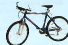
41 • Ross® Mountain Bike 2400 C-Notes, or $345.00

Shipping & Handling charges will be added to all orders.