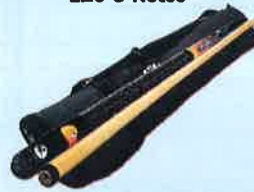
11 • "The Miz" Pool Cue 355 C-Notes, or $55.00