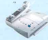
13 • Cordless Phone 610 C-Notes, or $80.00