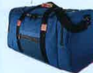
14 • Road Trip Duffle 230 C-Notes, or $36.00