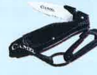
37 • Biker Knife 135 C-Notes, or $20.00