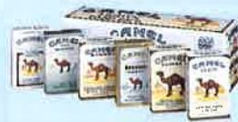
1-8 • Camel Cartons 120 C-Notes

SURGEON GENERAL'S WARNING: Smoking Causes Lung Cancer, Heart Disease, Emphysema, And May Complicate Pregnancy.