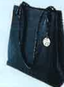
38 • Downtown Handbag 125 C-Notes, or $18.00