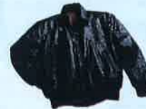
18,19 • Leather Bomber 920 C-Notes, or $135.00