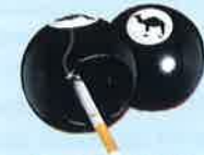
10 • 8-Ball Ashtray 40 C-Notes, or $5.00