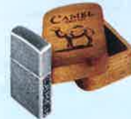
35 • Zippo® with Wood Box 150 C-Notes, or $23.00