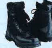
20-33 • Road Boots 420 C-Notes, or $65.00