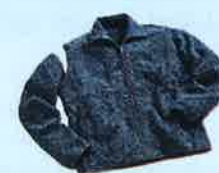
39,40 • Convertible Fleece 225 C-Notes, or $35.00