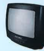
36 • 13" Color TV 1280 C-Notes, or $150.00