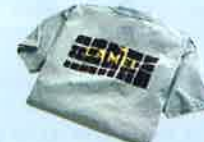
12 • Road Tee 60 C-Notes, or $12.00