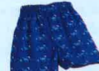
15,16 • Camel Boxers 35 C-Notes, or $5.00