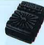
9 • Zip Guard Zippo® 115 C-Notes, or $16.00