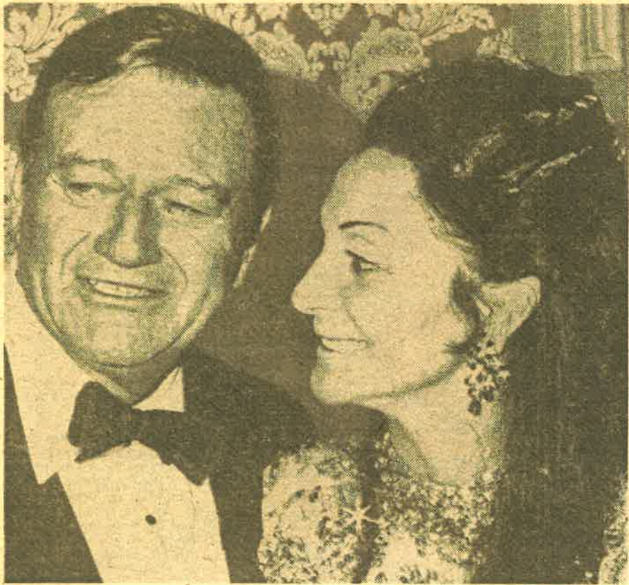
THE CONVERTED... John Wayne with his third wife Pilar Palette, who is Catholic. He changed to her religion in the last hours of his life

The Post also publishes today the first part of a major series on the John Wayne the world never saw. His tantrum-throwing childhood and his early life in a "miserable little shanty." See Pages 27 and 30.