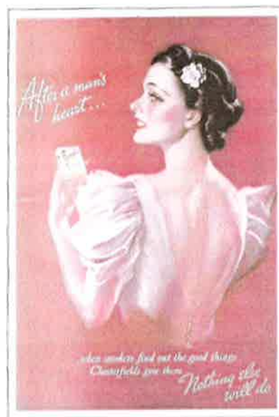
THE WORLD CIGARETTE PANDEMIC

DECEMBER 1983 • Volume 83, Number 13 Table of Contents, page 1243