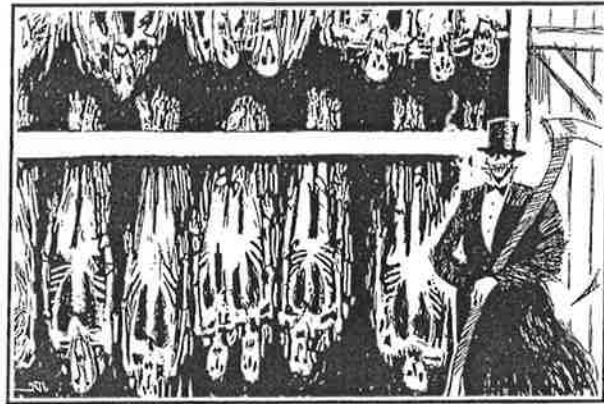
Cash Crop II