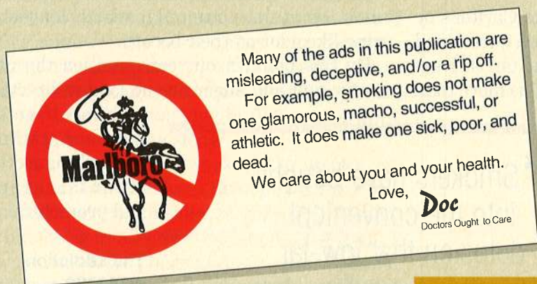
FIGURE 1: Counter-advertising is one strategy used by Doctors Ought to Care in their efforts to target tobacco sponsorship and advertising. These labels, available from DOC at 5510 Greenbriar, Suite 235, Houston, TX 77005, can be attached to magazines in your waiting rooms that carry cigarette advertising.

I ask whether he buys Marlboro Lights, Menthol Lights, Mediums, 100's, and box or soft-pack. (There are more than 15 different versions, which helps highlight the way cigarette companies create the illusion of choice and individuality.) And apart from the package design and advertising, do "men's" cigarettes really differ from "women's" cigarettes? I'm trying to help him realize he is buying the package and the underlying message of masculinity, not just cigarettes (for an approach to use with youngsters, see "Keeping kids out of Marlboro Country"). Many men are surprised to learn that Marlboros were originally marketed for women, using the slogans "Mild as May" and "Red tips to match your pretty lips." When the patient leaves the office, I want him to be aware of his manipulation by advertising and packaging techniques and to respond in part by not buying cigarettes—out of spite if nothing else.