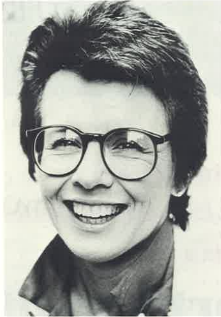
Billie Jean King, Virginia Slims Series National Spokesperson for LVA

“Everyone is born with the potential to learn, achieve and win. But for the 27 million American adults who cannot read or write, that potential remains unrealized. Tasks that others take for granted become impossible obstacles. They cannot fill out a job application, follow instructions on a medicine bottle, or even share a bedtime story with a child.