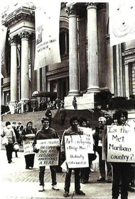
DOC protesting at the Metropolitan Museum of Art, 1983.

ment, was sponsored by Philip Morris' Virginia Slims cigarettes. Proceeds from the Jan. 14, 1977 Virginia Slims tournament were gratefully received by the Broward County chapter of the American Cancer Society.