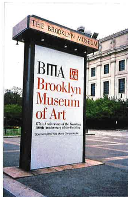
The Brooklyn Museum of Art, 1998.

Moreover, as Wall Street Journal arts critic Terry Teachout observed in a Feb. 27 column " Museums and Shaming ," P.A.I.N.'s take-no-prisoners targeting of the Sackler family includes the philanthropy of the late Arthur Sackler, MD, who was not connected to OxyContin, which was introduced nearly a decade after his death in 1987.