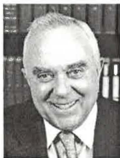
Joseph Califano Jr.

The federal report followed closely on the heels of the 40th anniversary of