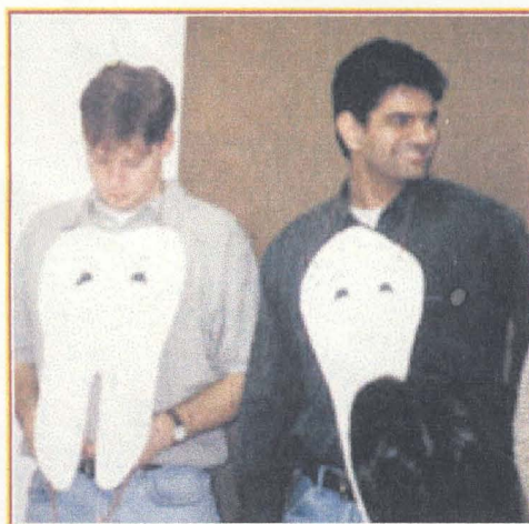
DDS students teaching in an inner city classroom