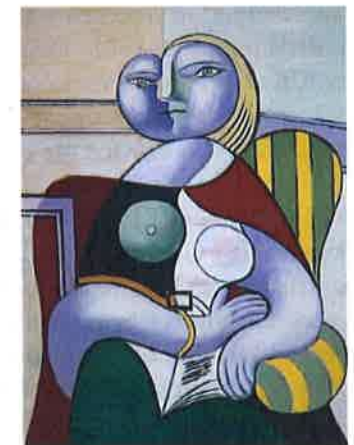
Reading, 1932

Friends, lovers, and artists who influenced Picasso play a seminal role in the exhibition. Portraits of his mistresses, such as Reading (1932) and Portrait of Dora Maar (1937), feature his muses in various emotional states ranging from regal composure to inconsolable despair. Works ranging from studies for his early groundbreaking Les Femmes d’Alger (O. J.) (1907), to some of the last works of his career show his connection to, and often competition with, other notable artists from his past and present such as Henri Matisse, Georges Braque, Paul Cézanne, and Diego Velázquez. The exhibition includes examples of almost every medium in which Picasso worked —oil on canvas and panel, cast bronze, carved wood, assemblages of found materials, watercolors, drawings in pastel, charcoal, pencil, and ink; various printmaking techniques, and illustrated books.