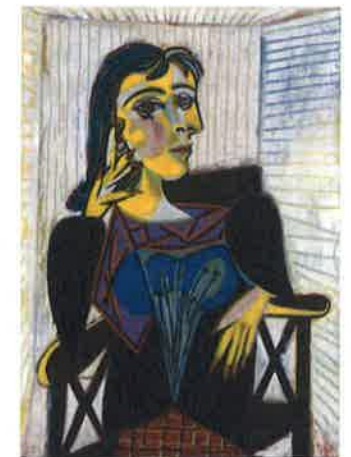
Portrait of Dora Maar, 1937, Pablo Picasso (Spanish, 1881–1973). Oil on canvas, 36¼ x 25 9/16 in. (92 x 65 cm). Musée National Picasso, Paris ©2010 Estate of Pablo Picasso / Artist Rights Society (ARS), New York.

"We are extremely proud to be partnering with VMFA to bring such a significant art exhibition to our Richmond headquarters community," said Marty Barrington, vice chairman of Altria and VMFA trustee. "With the Picasso exhibition, VMFA continues to realize its vision of world-class quality