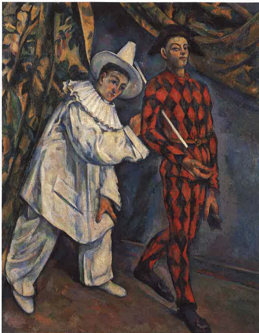
PAUL CÉZANNE, Pierrot and Harlequin , 1888, oil on canvas, 40 x 31 7 / 8 inches, The State Pushkin Museum, Moscow.

In Atlanta, additional support is provided by the Forward Arts Foundation Endowment Fund, NDCHealth, and friends of the Museum.