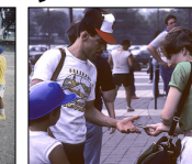
Sampling at Events