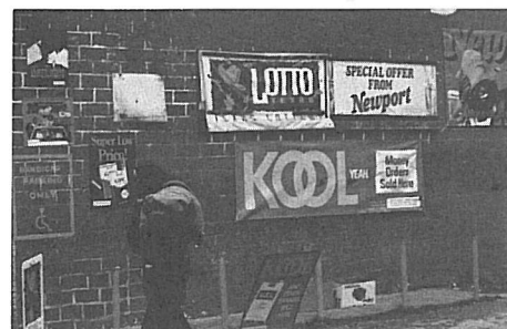
DOC-led community field trip, North Forest (Houston), Texas.

The grant is a two year program designed to empower local citizens who are sick and tired of being always spotlighted in negative stories in the news. Said one participant, "It is like a breath of fresh air. Thank you for caring about our community."