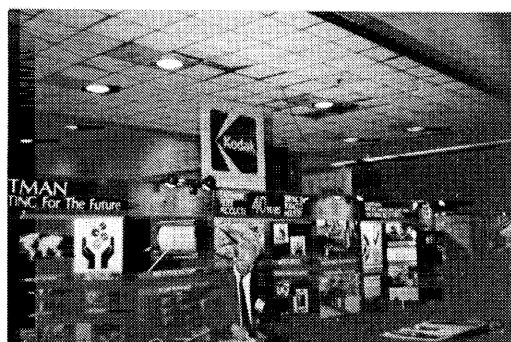
Figure 3 Kodak exhibit at fourth international exhibition, Raleigh, North Carolina, 1–4 June 1992. The exhibit featured the company's cellulose acetate material, supplied to the tobacco industry around the world, as well as the company's visual monitoring system to check for imperfections in cigarette packaging

for the pharmaceutical industry to produce granulated medications. Eastman Kodak's Videk Systems Division makes visual inspection systems for cigarette packaging, as well as for pharmaceutical packaging; another Kodak affiliated company, Eastman Chemical Products, Inc, Kingsport, Tennessee, in 1992 celebrated the 40th anniversary of its development of cellulose acetate cigarette filter material (figures 2 and 3). Kimberly-Clark, Roswell, Georgia, the maker of Kleenex tissue, Kotex sanitary towels and tampons, Huggies disposable diapers (nappies), protective surgical masks, gowns, and hospital supplies,